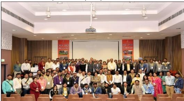
Feedback session during IIRS Academia Meet (IAM)-2020

IIRS has conducted workshops and sessions during IIRS User Interaction Meet to take feedback from participating institutions to improve the quality of future courses.