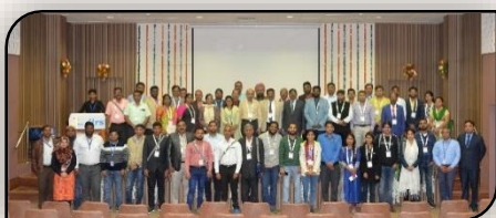
Feedback session during IIRS User Interaction Meet (UIM)-2020

IIRS has conducted eleven workshops in 2007, 2009, 2010, 2013, 2014, 2015, 2016, 2017, 2018, 2019, 2020 and 2021 to take feedback from participating institutions to improve the quality of future courses.